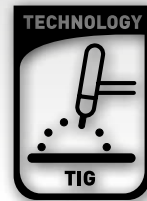
Insquare 421 AC/DC