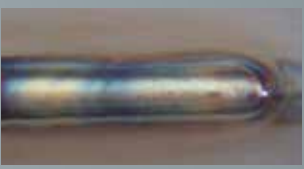
Standard TIG weld