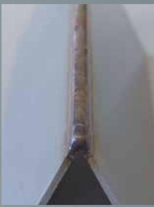
High frequency pulse for perfect corner welds