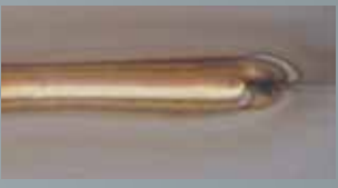
High frequency DC pulse weld