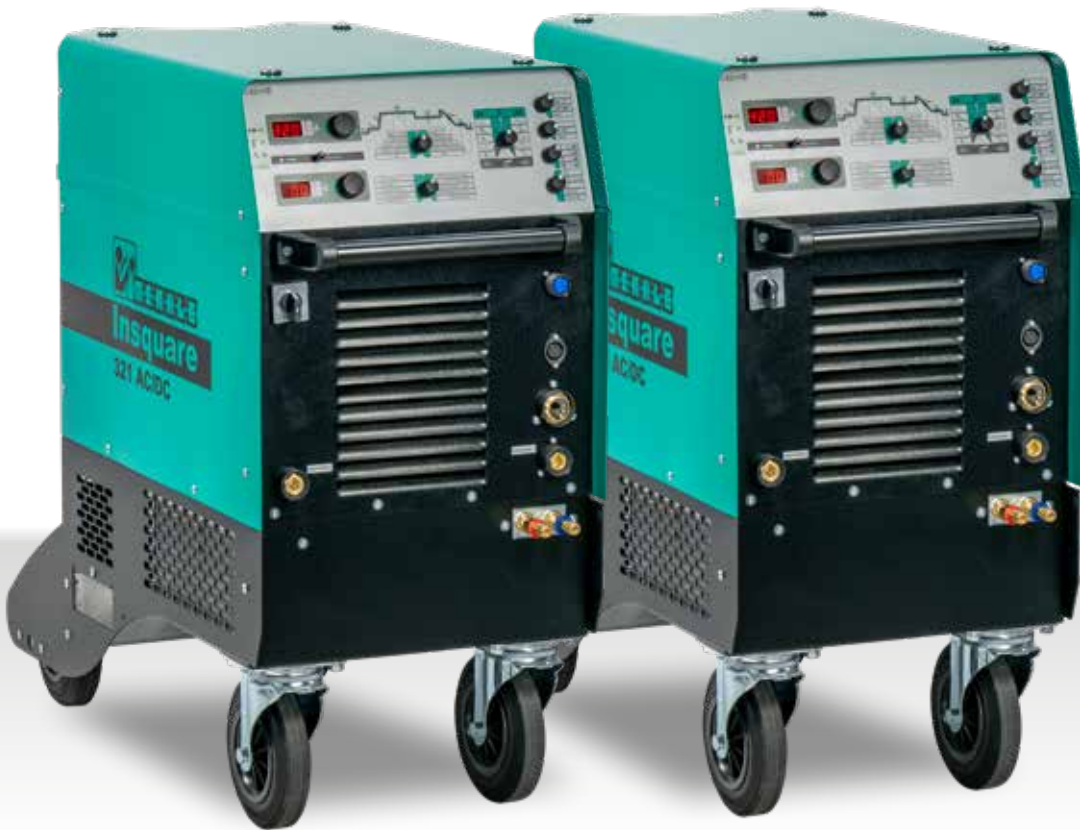
Insquare 321 AC/DC