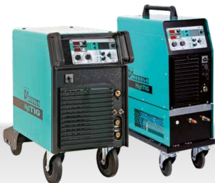
HighTIG W 350 DC