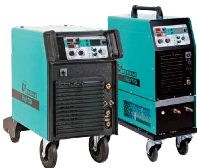
HighTIG W 350 DC

The compact and robust welding units of the HighTIG series are available for applications in TIG DC welding. With welding currents of 350, 450 and 550 A, all areas of application are covered. The units are designed for industrial production and can be used perfectly for manual, automatic and robot welding solutions.