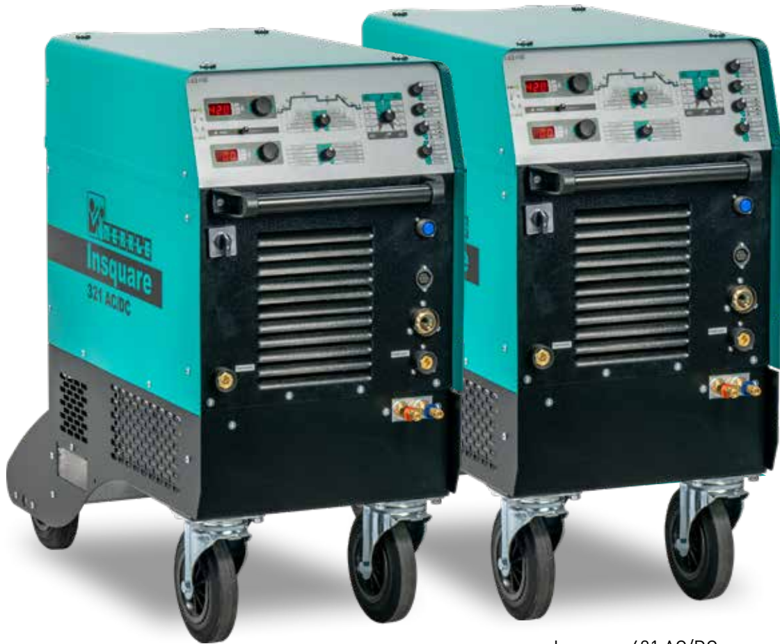
Insquare 321 AC/DC